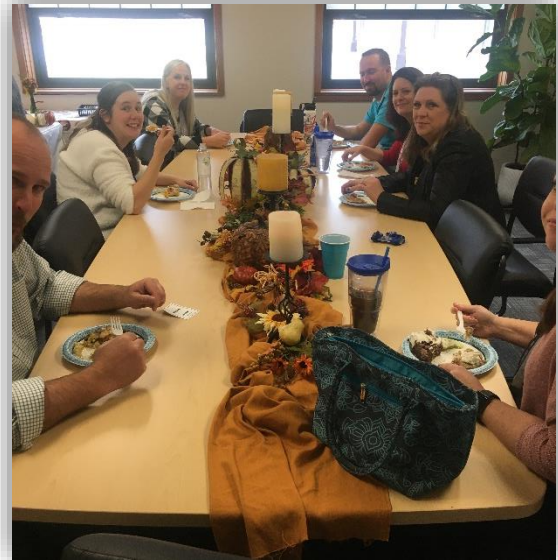
The staff at Snowcrest Junior High enjoyed their traditional Pie Day to celebrate our gratitude for the many blessings we have. The showed off their culinary skills by making pizza pies, chicken pot pie, pear pie, pumpkin pie, key lime pie, and apple pie, just to name a few. We had a delicious feast.