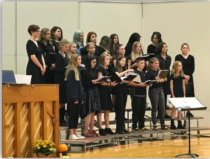
Family, students, and friends enjoyed Snowcrest's Fall Concert presented by our band, choir, and orchestra.